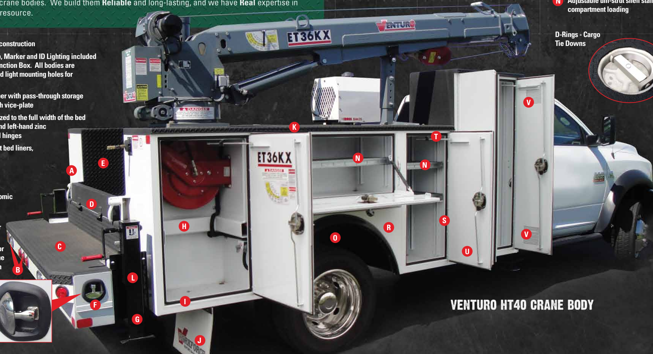
VENTURO HT40 CRANE BODY